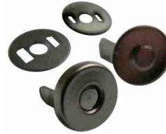
magnetic snap closure # sn9