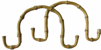
bamboo handle # hb4